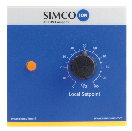
Remote control kit optional