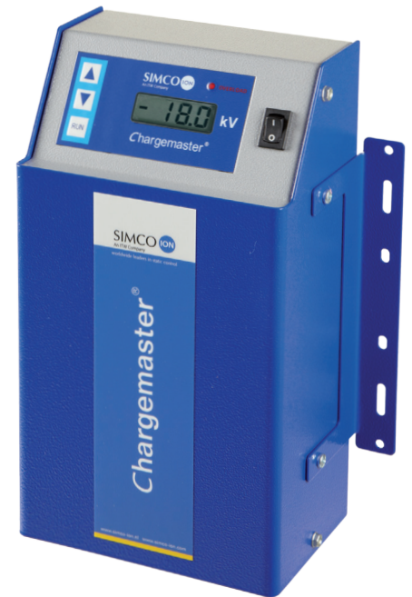
CM for wall mounting with 180° turned frontpanel