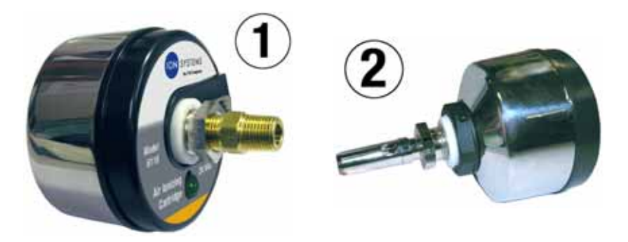
Figure 3. Connecting the Adapter and Nozzle Pieces