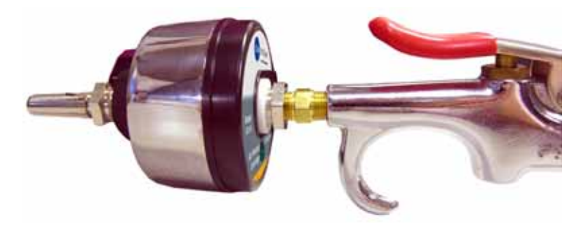
Figure 4. Connecting the Gun Handle to Adapter Piece