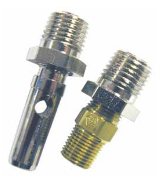
Figure 1. Nozzle and Adapter Pieces included with the Model 6110A