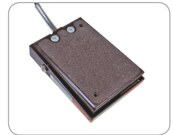
Optional hands free foot pedal.