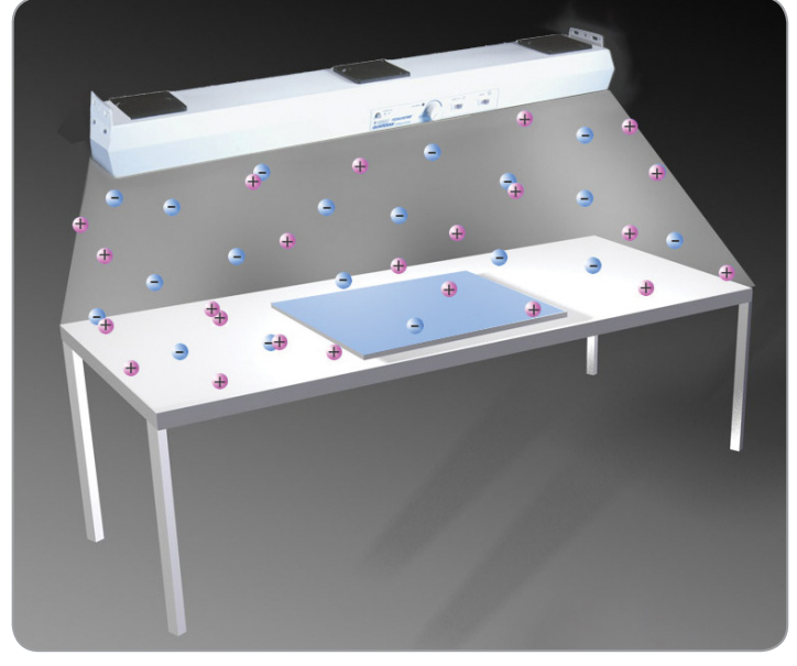
Overhead Ionization application

Discharge time in seconds (1000-100V), fan speed set to high. Guardian blower 18" from CPM measuring plate. CPM test plate 1" from table. Discharge times slightly longer for 230 VAC, 50 Hz unit.