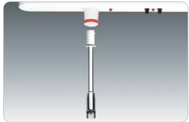
The Model 5509e has several options for emitter rod size. Its modular design makes it easy to exchange one size for another to accommodate a variety of cleanroom conditions.

In addition to the advanced features mentioned above, the 5509e ceiling emitter represents the same quality and reliability people expect from Simco-Ion. Simco-Ion has set the standard for over 15 years with leading-edge room ionization systems, and industry-best reliability.