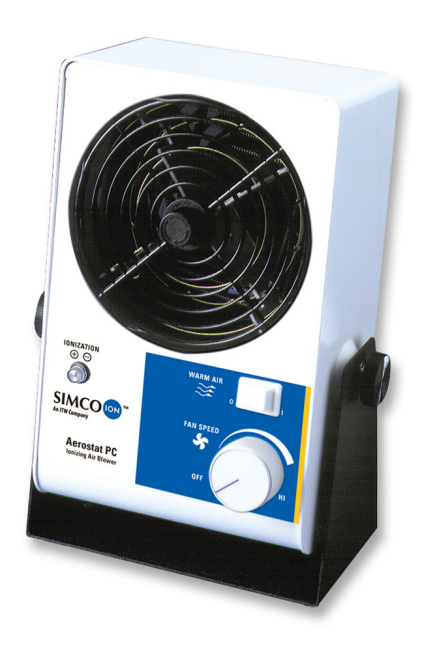
Figure 1. Aerostat PC Ionizing Air Blower

The Aerostat PC ionized air blower produces an airflow that is rich in positive and negative ions. Directing the airflow on an object that has an electrostatic charge will neutralize the charge. If the object has a negative charge, it will draw positive ions from the airflow. Conversely, if the object has a positive charge, it will draw negative ions from the airflow. The air ions are attracted to the oppositely charged object and neutralize the charge on the object.